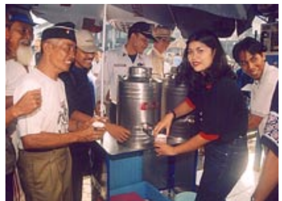
Fig. 3 Campaign partners provide free drinks at the Surabaya Car Free Day.

Each of these activities can be ‘scaled’ up or down according to the available budget.