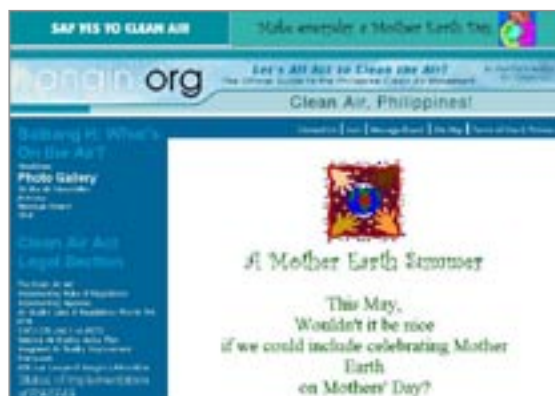
Fig. 2 Save the Air, Partnership for Clean Air, Manila