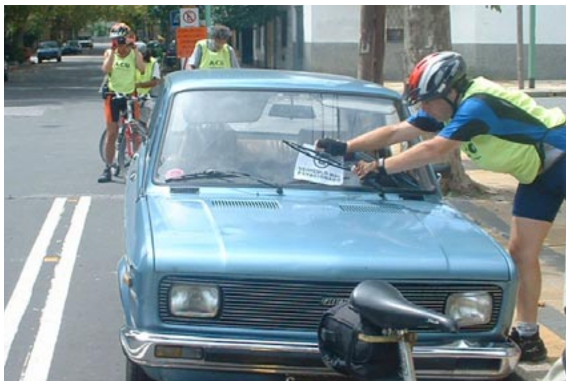
Fig. 5 A Buenos Aires Urban Cyclist Association member places a leaflet on a car parked in a bike lane, pointing out that parking is prohibited. The back of the leaflet contains basic information and contact details for the Association.

Government officials may be particularly appreciative if the BUG can do their work for them, by submitting detailed and feasible proposals based on surveys and ‘rapid assessment’ studies conducted by the BUG.