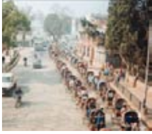
A range of developing cities are taking part in global movements, such as Car Free Days. In honour of Earth Day, Clean Energy Nepal sponsored a car free day on 22 April 2002. They specifically mandated highly-trafficked areas of the city for the car-free zones and encouraged the rest of the city to voluntarily refrain from using motor vehicles for the day (source: www.earthday.net ). The photo shows a similar event held in 2001.