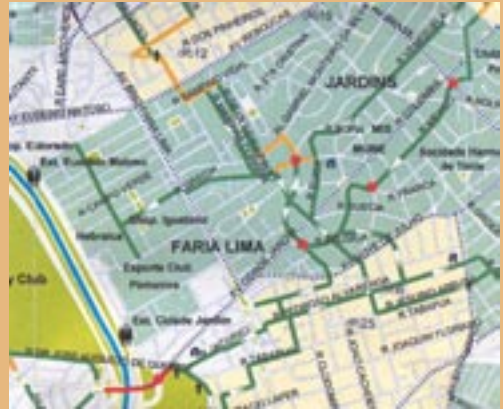
A detail from the map