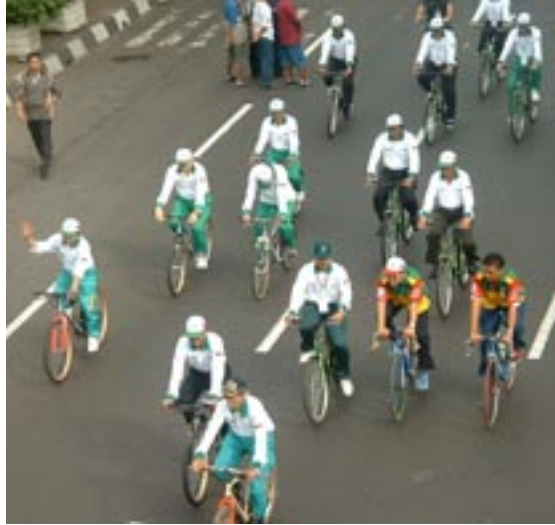
Fig. 8 The Head of the Surabaya City Council and leading officials take part in a Car Free Day held in Surabaya on 30 May 2002.